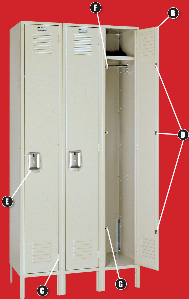
Standard Quiet Design